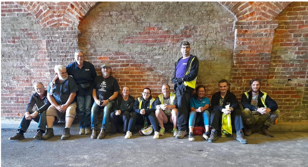
Some of the Reigate Caves team at the end of a busy day

In the Southeast, WCMS runs open day events each summer in the sand caves in Reigate, Surrey, under a licence from the local council. These old sand mines and cellars are a few of several subterranean sites of the area that have kept members busy since the 1960s. WCMS has also invested a good deal of effort and money into protecting and studying the old mine-workings in the Upper Greensand of East Surrey. This includes surveying, conservation, archival research, keeping the sites as secure and safe as practically possible, and working with other parties such as the Historical Royal Palaces Agency, National Trust, local authorities and various relevant landowners.