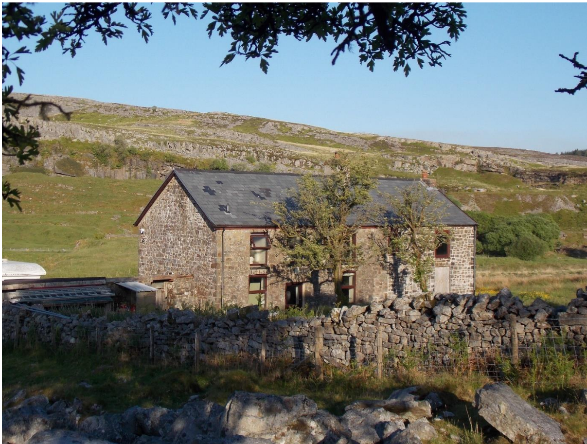
“The Stump”, properly known as Penwyllt Inn, the WCMS cottage on a sunny day!

Since 1984, in anticipation of the day when we would have to move on, the club has accumulated funds with the aim of acquiring our own base somewhere. In 2010, we signed a lease agreement with South Wales Caving Club to restore and occupy Penwyllt Inn, more commonly known as “The Stump”. The bulk of our building fund was used in the restoration of this 1860s cottage, and we are justifiably proud of the result of the work we have had done here. Our membership numbers have grown significantly since 2010, largely a result of cavers joining who have discovered how good a base it is for caving in South Wales, combined with our welcoming nature as a club.