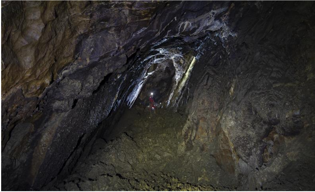
Adrian Fawcett in East Passage.

Pen Park Hole is located under a small public park in Southmead, north Bristol. The land is owned by the city council and the cave has been designated a SSSI by Natural England. The cave is gated and locked – as would be expected for a site so close to domestic housing – and access is administered by a consortium of three caving clubs, the BEC, UBSS and WCC.