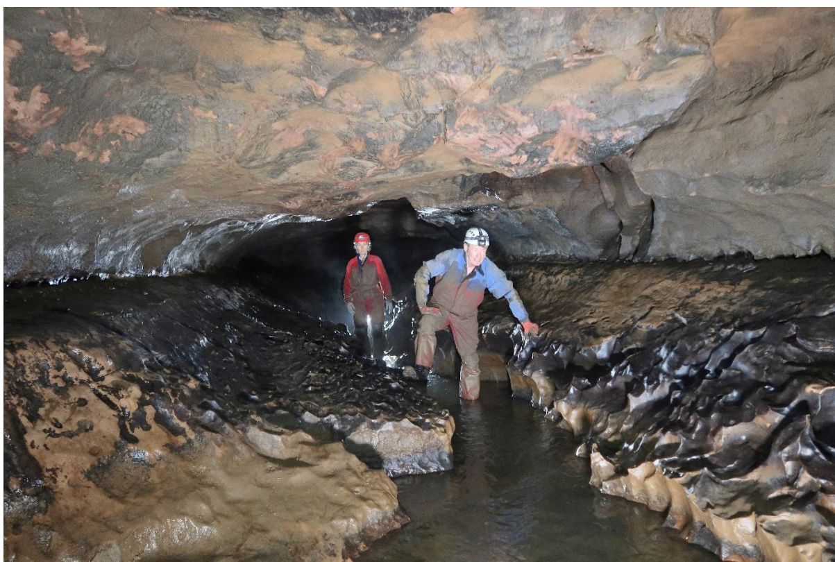
Lower Streamway, Slaughter Stream Cave

Many Forest iron mines and Cotswold stone mines have also been the subject of GSS exploration digging, surveying, conservation and archaeology, such as at Old Ham, Noxon Park, Westington and Windrush and significant GSS work is still underway in some of these and other locations.