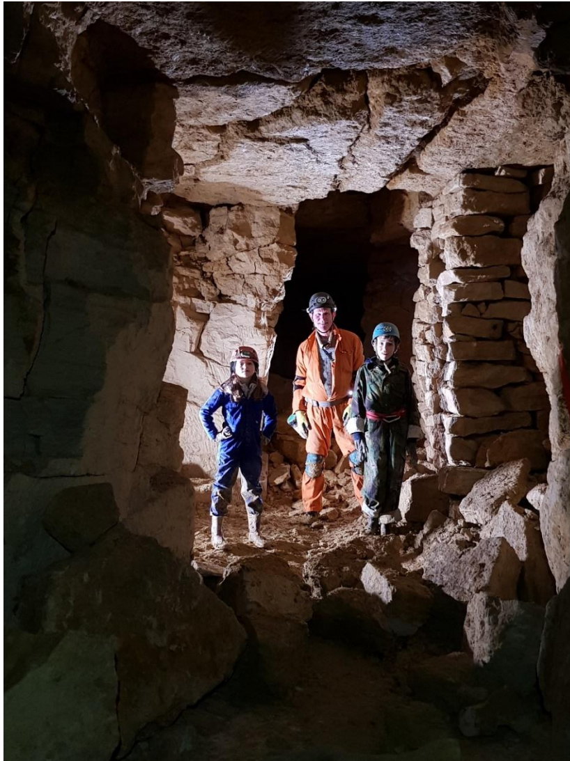
Windrush Quarry, the Cotswolds

The GSS was formed in July 1956 following earlier ad hoc underground activities from the late 1940's onwards by two groups of Gloucester and Cheltenham school boys/scouts. The school boys had been inspired not only by a spirit of adventure but by scientific curiosity about caves and local mines in the Cotswolds and Forest of Dean. Some of them had found a rare Bechstein's bat dying on the street in Gloucester and their science teacher further reinforced that inspiration, such that bat studies remained a core GSS interest and activity for many decades following.