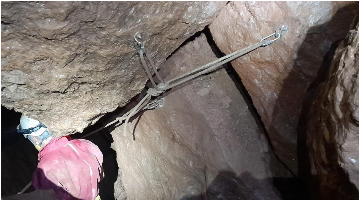
New maillons on the rope climb to Land of Hope and Glory.

Visits to Wookey remain popular with 7 trips consisting of some 40 cavers having taken place since August.