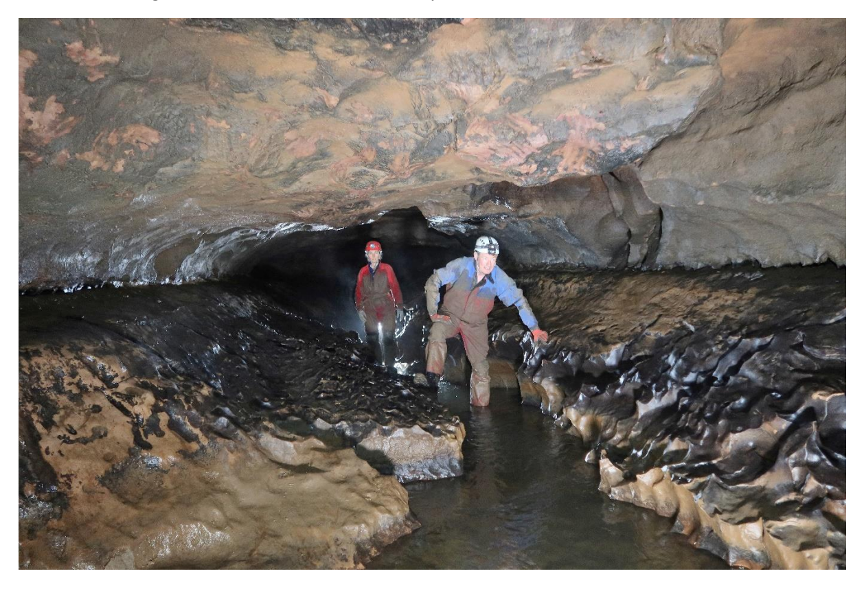
Lower Streamway, Slaughter Stream Cave

Many Forest iron mines and Cotswold stone mines have also been the subject of GSS exploration digging, surveying, conservation and archaeology, such as at Old Ham, Noxon Park, Westington and Windrush and significant GSS work is still underway in some of these and other locations.