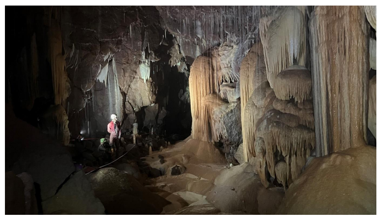
Long Straw Chamber, Otter Hole

result, the Forest caves include Otter Hole, one of the most beautifully decorated caves in the UK and the Slaughter Stream Cave which at 14km is the UK's longest cave formed in dolomite and which contains many interesting geological and speleogenetic features, such as unworked iron ore veins and manganese deposits.