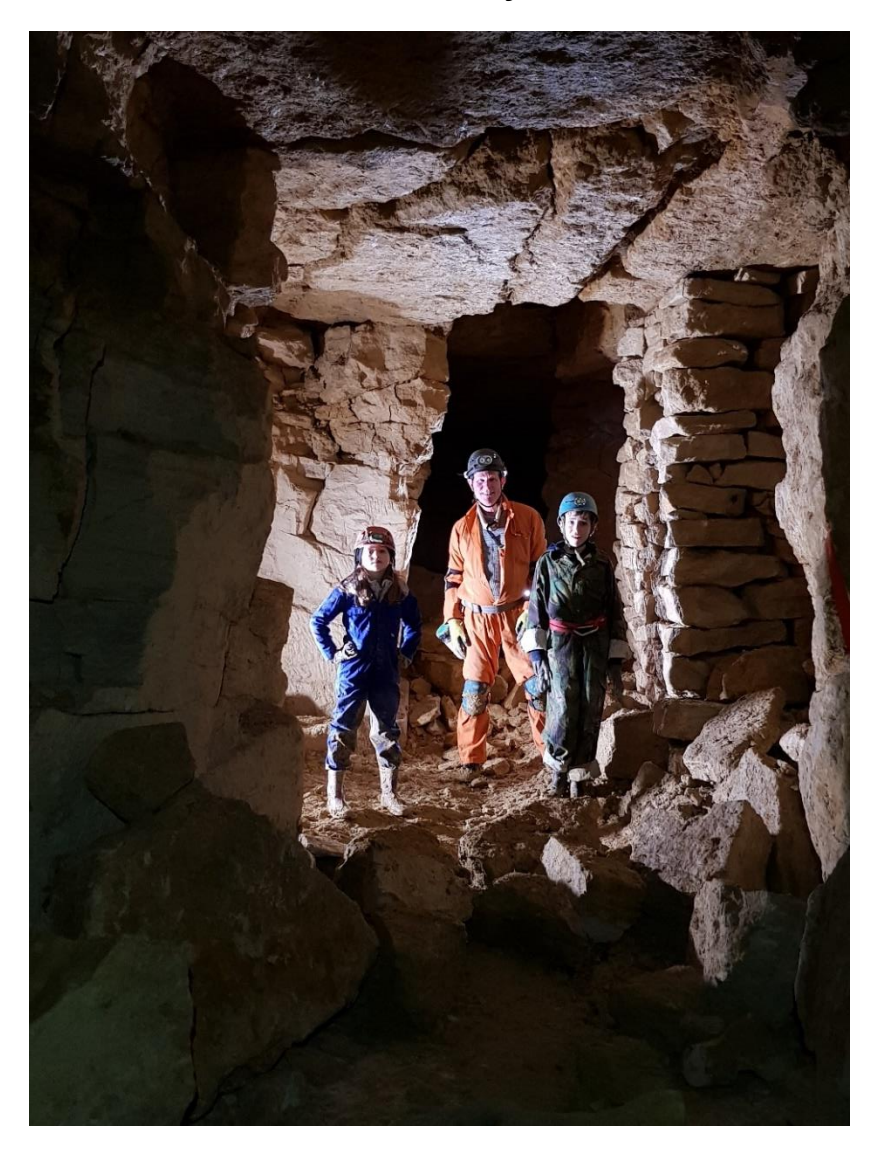
Windrush Quarry, the Cotswolds

The GSS was formed in July 1956 following earlier ad hoc underground activities from the late 1940's onwards by two groups of Gloucester and Cheltenham school boys/scouts. The school boys had been inspired not only by a spirit of adventure but by scientific curiosity about caves and local mines in the Cotswolds and Forest of Dean. Some of them had found a rare Bechstein's bat dying on the street in Gloucester and their science teacher further reinforced that inspiration, such that bat studies remained a core GSS interest and activity for many decades following.