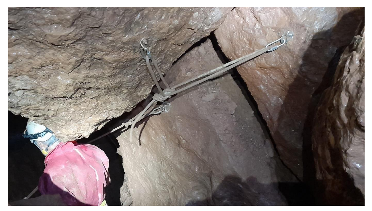
New maillons on the rope climb to Land of Hope and Glory.

Visits to Wookey remain popular with 7 trips consisting of some 40 cavers having taken place since August.